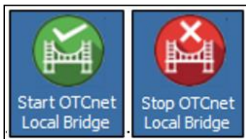
Figure 3. Start and Stop OTCnet Local Bridge icons