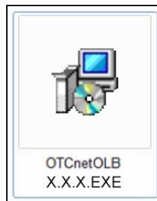
Figure 1. OTCnet Local Bridge

The EXE must be launched and executed by a Windows Administrator.