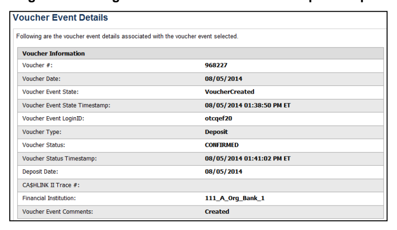
Figure 2: In Progress Voucher Event Details Report Output

Click a Voucher Event State hyperlink to view the voucher event details. The Voucher Event Details page appears as shown in Figure 2.