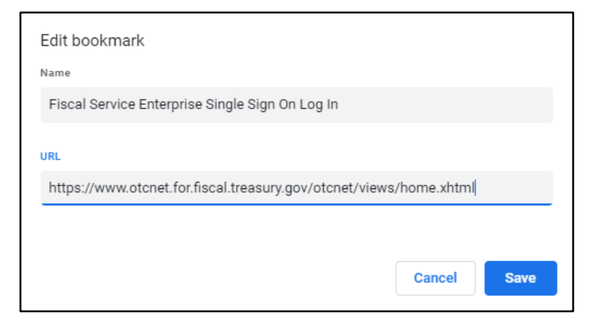
Figure 3. Google Chrome Edit Bookmark

4. Click Edit and enter the new OTCnet URL: <a href="https://www.otcnet.for.fiscal.treasury.gov/otcnet/views/home.xhtml">https://www.otcnet.for.fiscal.treasury.gov/otcnet/views/home.xhtml</a>, and click Save . See Figure 3 .