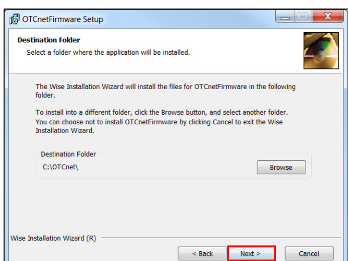
Figure 1. Destination Folder Dialog Box